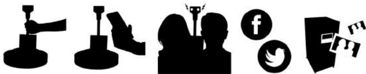
Table Selfies can be placed on multiple tables and combine with other centre pieces. All photos captured are stored on a central hub, which can all transfer onto a USB at the end of an event.

The latest must have gadget table decoration for any sit down occasion. Positioned in the centre of a table, the Table Selfie captures photos of all guests. Spin the Table Selfie and connect with your phone to initiate a countdown. The Table Selfie camera will take a photo that can be saved, shared on social media, or printed.