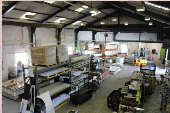
On Site Factory