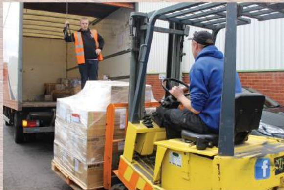
UK Manufactured Products

Situated in the heart of England, Halesowen - based in the West Midlands. Our products are individually hand crafted, from the original design concept to manufacturing, all on site.