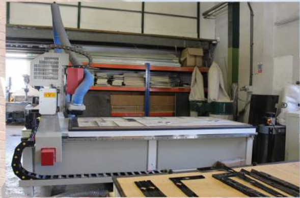
High Specification Machinery